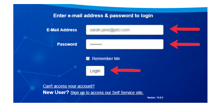
Step 7: The first time you login, you'll be asked to change your password.